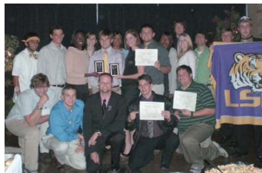
2006 RHA Delegation

The session was an interactive game where participants had to make choices and take chances in order to explore the possible outcomes of illegal on-campus drug activity.