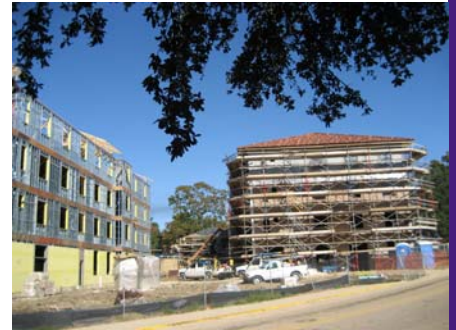
Construction of Graham Residential College Complex

Future major construction projects include the renovations of East and West Laville Hall—to be completed by 2011.