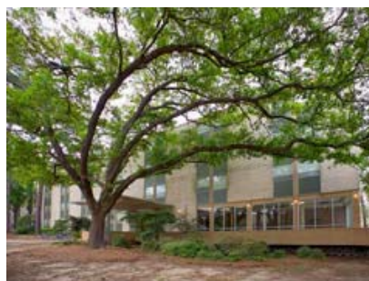
McVoy Hall—Current Home of Global Studies

ners. Next year, Global Studies will officially become a residential college, accepting both freshmen and sophomores, and will move to LeJeune Hall as part of an exciting new community of residential colleges. And, as the trend toward globalization continues, we anticipate continued growth and increased student interest in the Global Studies program!